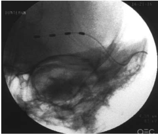
Figure 3. Supraorbital stimulator on 76-year-old female (Patient 2).

IPG as positive, pulse-width 390 \mu\text{sec} , at a frequency of 50 pulses/sec. Amplitude was adjusted by the patient, depending on discomfort, and would range from “off” to 3 V. If the rate was increased above 110 pulses/sec., the patient would report an uncomfortable itching or pressure sensation.